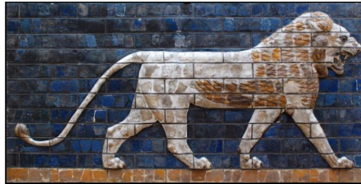
THE LION OF BABYLON CIRCA 575 BC - ISHTAR GATE BUILT BY NEBUCHADNEZZAR II