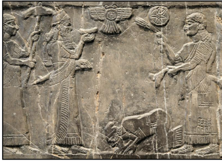
KING JEHU OF ISRAEL BOWING TO SHALMANESER OF ASSYRIA CIRCA 825 BC - BLACK OBELISK OF SHALMANESER