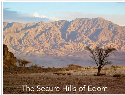
The Secure Hills of Edom

The LORD will judge because they handed over fugitives to the enemy (1:14).