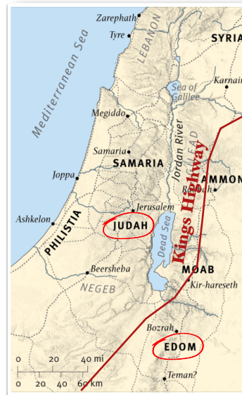
Israel in Relation to Edom